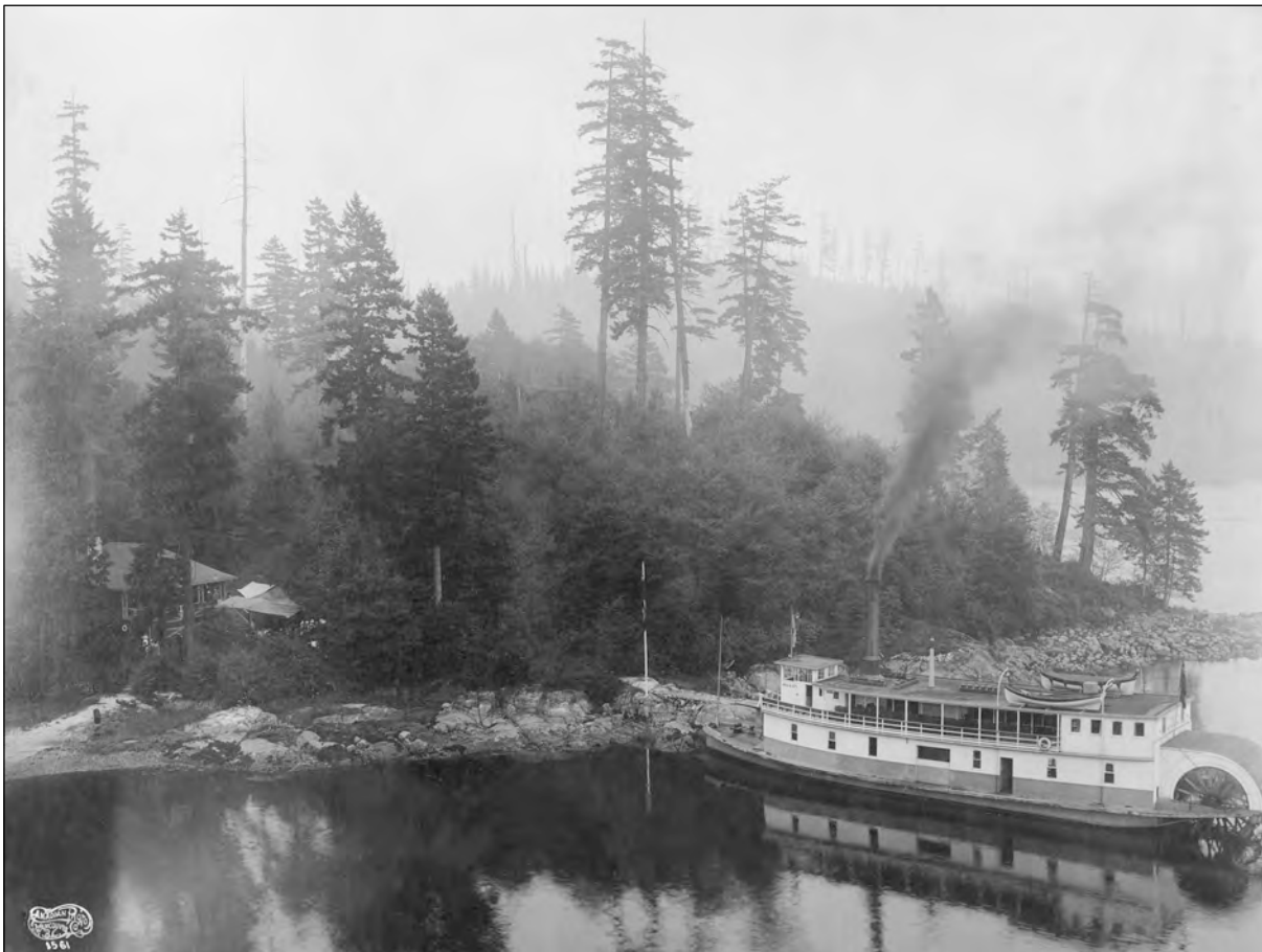
Sternwheeler ‘SS Alluvia’ at ‘Wade’s Landing’ on ‘Turtlehead’ in Belcarra, August 6 th , 1914.

The visiting delegates were to be entertained today [Thursday, August 6 th , 1914] with an automobile drive around Point Grey and the city, and this afternoon to a launch ride on the Inlet, sailing to Mr. F.C. Wade’s residence on the North Arm [Turtlehead at Belcarra] by the steamer ‘Alluvia’, leaving the Grand Trunk Pacific wharf at 2 p.m.