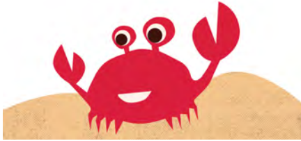
CRAB Corner By Penny Moen