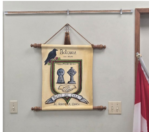
Sign in Belcarra, Ireland (left) and scroll in Belcarra, Canada (right)