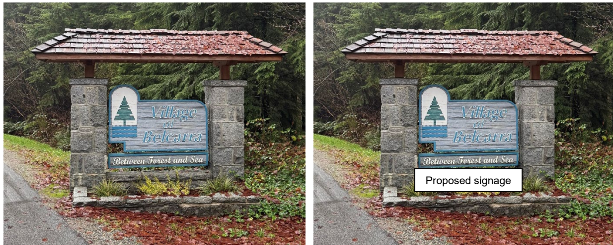
Existing sign (left) and proposed location for additional signage (right)

“Twinned with Belcarra (Baile na Cora), County Mayo, Ireland.”