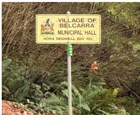
Existing sign at Village Hall entrance

Option 1 proposes to replace the existing 4' x 2' Municipal Hall entrance signage with a new 5' x 3' sign with the added wording "Twinned with Belcarra (Baile Na Cora) County Mayo, Ireland".