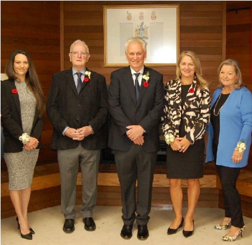
Our new Council sworn in on Monday, November 7, 2022.